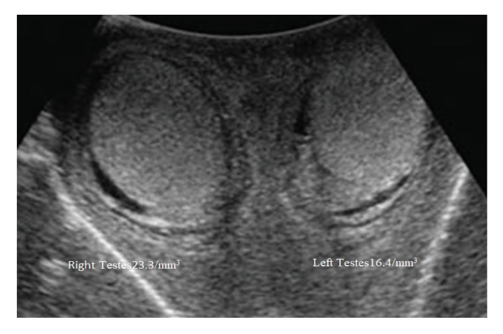
Figure 1. Testicles with elevated echogenicity on day 49 due to COVID-19 COVID-19: Coronavirus disease-2019