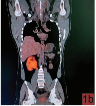
Figure 1. 1a. Axial section of computed tomography scan showing dilated right renal pelvis with parenchymal thinning. 1b. Coronal section of positron emission tomography scan showing physiological uptake in the right renal pelvis