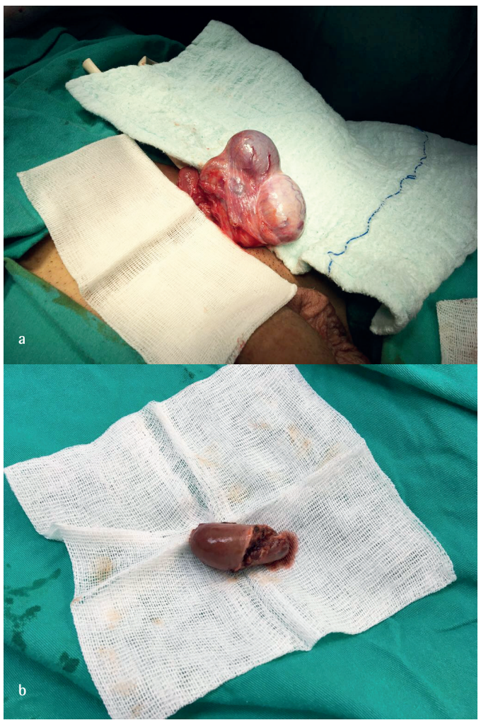
Figure 1. Macroscopic appearance of the mass in the operation (a) and after the excision (b)

Although many other congenital abnormalities, such as cardiac malformations, micrognathia, and spina bifida, have been reported in the literature, the most common abnormality is cryptorchidism. Duncan and Barraza (4) reported a case of SGF