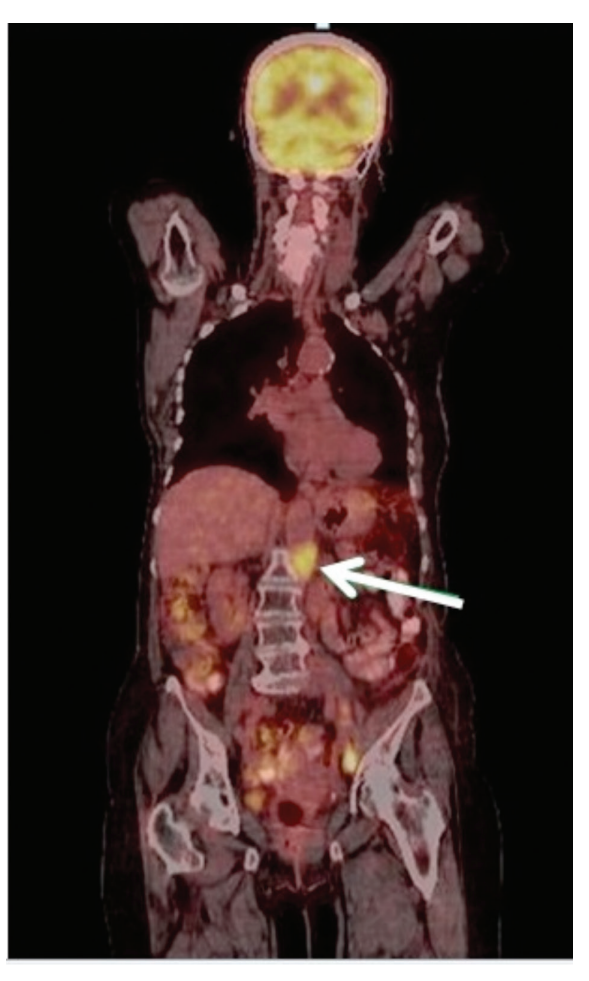
Figure 2. The coronal reconstruction of F-18 fluorodeoxyglucose positronemission tomography/computed tomography scans shows paraaortic lymphadenopathy (arrow), maximum standardized uptake value: 10.0

scans is challenging due to of the physiological urinary activity of FDG. The physiological <sup>18</sup>FDG excretion of the renal collecting system should be differentiated from malignant pathological activity. The excretion of <sup>18</sup>FDG from pelvicalyceal system limits the sensitivity and specificity of the procedure in diagnosing urothelial cancers. The low expression of glucose transporters responsible for intracellular deposition of <sup>18</sup>FDG is one the most important reasons for reduced sensitivity in diagnosing primary urothelial carcinomas (10). However, re-staging of UTUC using <sup>18</sup>FDG-PET/CT scans after radical nephroureterectomy overcomes the challenges pertaining to the urinary tract in monitoring response to treatment after chemotherapy and radiotherapy. Therefore, it allows the diagnosis of the lesions with higher accuracy and specificity. This method has some limitations only in diagnosing upper urinary tract tumors and metachronous bladder tumor. However, this did not appear as a limitation in the current study due to the fact that none of the patients had local recurrence in the bladder and other parts of upper urinary tract.