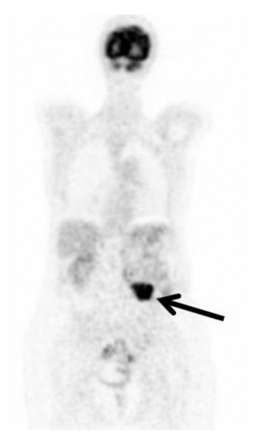
Figure 4. Maximum intensity projection images of a patient, interaortocaval lymphadenopathy (arrow)

In this regard, the sensitivity of <sup>18</sup>FDG-PET/CT scans in diagnosing regional lymph nodes can be further increased. Furthermore, FDG activity in the residual tissue after radiotherapy and chemotherapy may be useful in re-staging of the disease. MDCTU is used to detect lymph node or distant metastases however, it is known that metastasis can also come about in normal-sized lymph nodes. Therefore, false-negative results in MDCTU are a handicap for the use of this method in re-staging of UTUCs. Sun et al. (20) found positive correlation between the sensitivity of FDG and grade and stage of UTUCs. In their series of 27 patients with urothelial malignancies, Sun et al. (20) stated that PET could have a role in the prognosis of UTUC. In this study, the sensitivity and positive predictive value of FDG PET and CT were 67% vs. 59% and 90% vs. 84%, respectively (20). In a series of 13 cases with metastatic UTUC reported by Dou et al. (21), PET/ CT was used in re-staging of the disease. In the study, a SUV of 3.8 was detected for the metastatic lymph nodes measuring