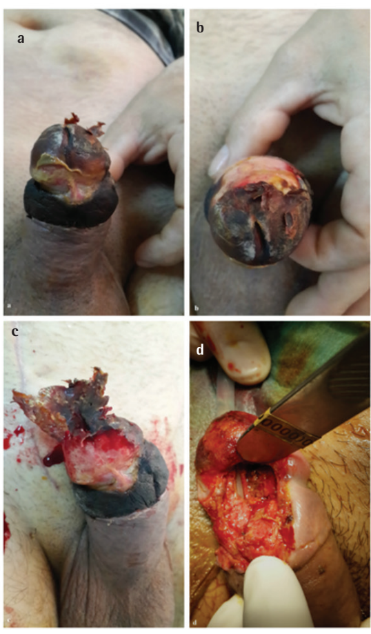
Figure 3. a) Ischemic necrosis of glans penis and sub-coronal area b, c) debridman of the necrotic tissue d) the view of glanulocavernosal dissociation and urethral laceration

Penile gangrene is an infrequent complication that can occur due to many reasons. Although generally seen in patients with diabetes and end-stage renal disease, other reported causes of penile gangrene involves trauma, vessel narrowing procedures, circumcision, vasculitis (3), acute occlusion of arteries, foreign bodies, Fournier gangrene, spider bites and topical treatment with 1% gentian violet (2). Also urine extravasation, priapism, narrow bands or pressure from clothing, Wegener's